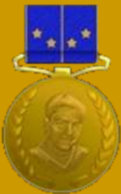
2018 SIMMING PRIZE LAUREATE

Since 2009, Theta Fleet has opened its doors to the downtrodden folk who had a rough go elsewhere, and to new writers seeking a more "Mayberry" like community, where having fun matters and respecting one's neighbor is the law of the land. When you choose Theta Fleet, you are choosing to be part of something bigger than all of us.